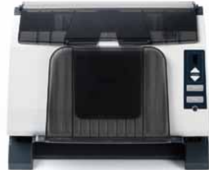
Input and output paper tray can be fold when not in use.