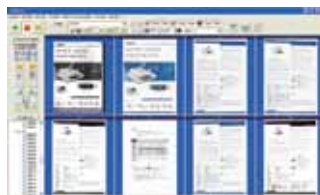
The AvScan 5.0 main screen

-The Intelligent Document Management Tool