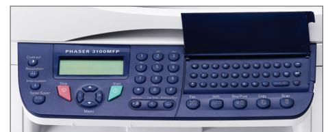
The Phaser 3100MFP/X features a full keyboard

Consumables for the Phaser 3100MFP are part of the Xerox Green World Alliance Supplies Recycling Program. For more information, please visit the Green World Alliance website at www.xerox.com/gwa